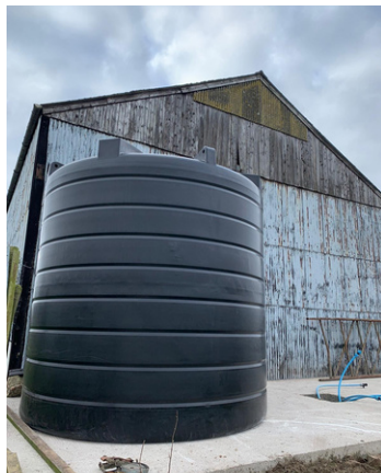
Water storage tanks arriving at a farm