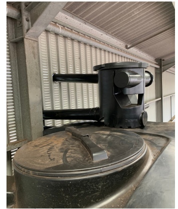
Water storage and rainwater tank filter at another farm